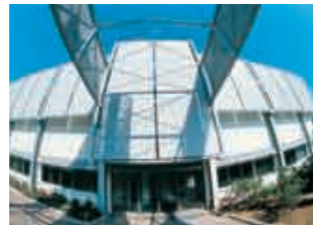
AR KELIO® Architecture & Signage