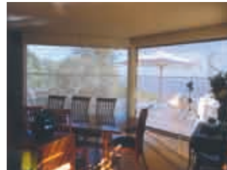
External Roller Blind Fabric