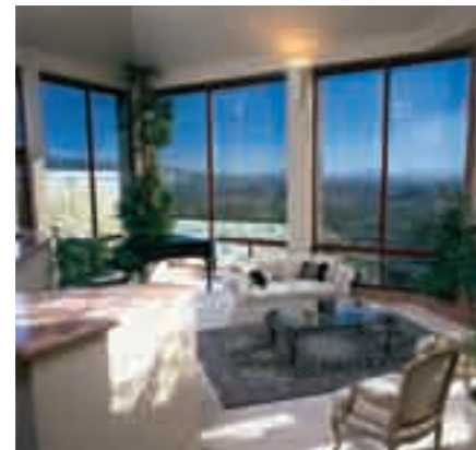
Internal Roller Blind Fabric