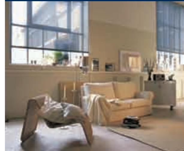
Internal Transparent Fabrics